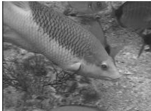
Spanish Hogfish Wrasse

We will try and have one or more of the clubs instructors available to assist practise